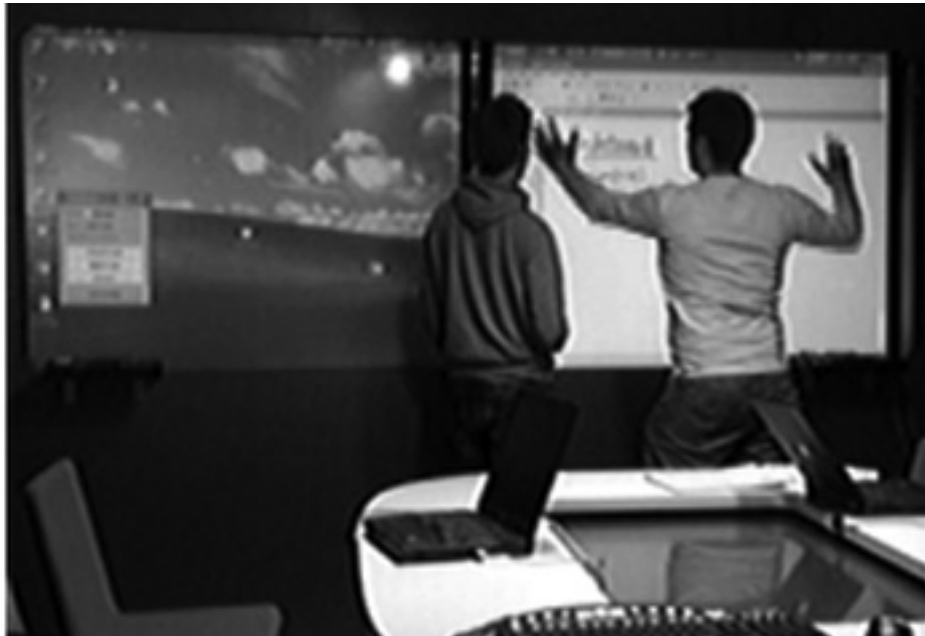
Figure 5. Students working in the iLounge.

In contrast to the design studio, the interactive space focused most interaction towards collective representations, such as interactive smartboards and other shared displays, as seen in Figure 5.