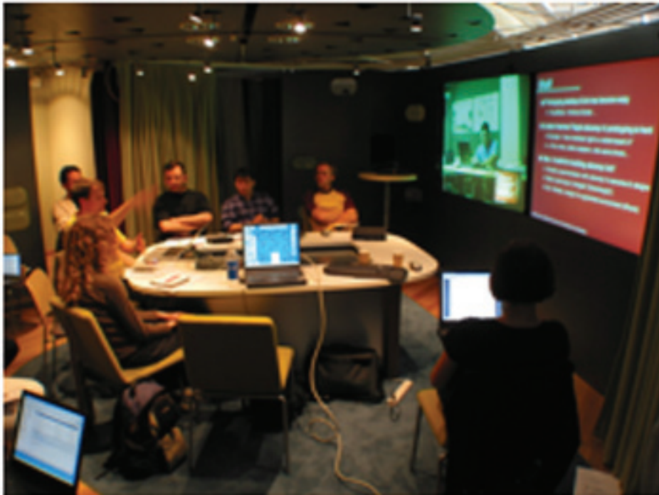
Figure 3. Work in the iLounge.