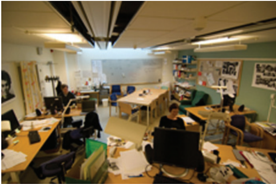
Figure 1. Students working in the studio.

At Linköping University, studio-based learning in interaction design has been practiced since 1997. The design studio is an open office workplace with space for eight students as well some workspaces intended for cooperative tasks (Figures 1 and 2). Some years, there have also been two studios. Each student has his/her own workspace with a personal computer and can organise and decorate it according to individual taste and purpose. The studio is also equipped with a large common whiteboard as well as a shared PC with projector.