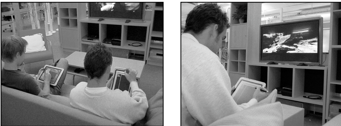
Figure 2: The current version of LOCOMOTION consists of two tablet computers and a PC with a plasma screen connected over the network.

REGULATING PROMINENCE can be realized in many different ways, but we wish to illustrate one way it can be implemented in a design. The LOCOMOTION system is a multimedia home platform derived directly from the pattern. It is based on two interconnected tablet computers and a PC with a large plasma screen, but other devices like mobile phones, handheld computers, personal video recorders and home-PCs can easily be integrated into the network. Users can move objects between the displays by a simple drag and drop. A user can tilt the tablet and make it peripherally public to the other in order not to interrupt the other’s activities. An object can be dropped on the drop-area for the plasma screen if a user wants to make an object prominent to the other. If one would want to make it really prominent to the other and also interrupt the others activity one can drop it on the other’s tablet. Finally, if a user want to keep something hidden, the tablet can be tilted so that others cannot see the screen. In order to provide this, the system is built around a distributed event manager that allows the drop events to be transferred between different devices (see Figure 2).