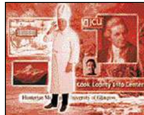
BY MIGUEL SALMERON

Moreover, these systems usually carefully limit the questions that can be asked so that the computer can answer reliably—or answer at all. The problem is reminiscent of Gödel's theorem from mathematics: any system that is complex enough to be useful also encompasses unanswerable questions, much like sophisticated versions of the basic paradox "This sentence is false." To avoid such problems, traditional knowledge-representation systems generally each had their own narrow and idiosyncratic set of rules for making inferences about their data. For example, a genealogy system, acting on a database of family trees, might include the rule "a wife of an uncle is an aunt." Even if the data could be transferred from one system to another, the rules, existing in a completely different form, usually could not.