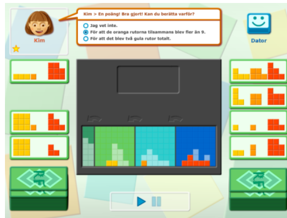
Fig. 1. The virtual learning environment, with the math game and on-task dialogue.

activities (i.e. playing the game and on-task dialogue) and off-task activities (i.e. social conversation). The purpose of the more social conversation is to enrich the game and its motivational qualities for the age group in question and ultimately to enable pedagogical interventions, such as supporting pupils' math self-efficacy and change negative attitudes toward math in general. In this paper we describe the iterative development of the conversational capabilities.