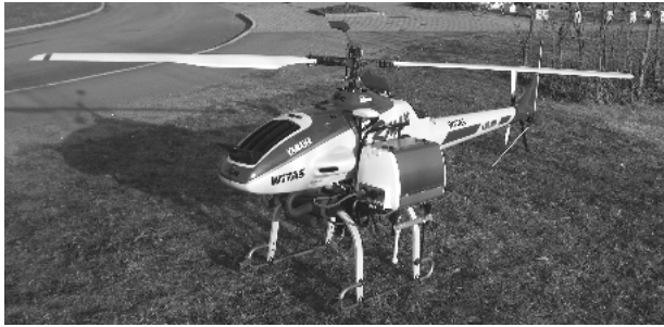
Figure 1: The WITAS RMAX Helicopter

puter (PIII 700MHz), a color CCD camera (S-VIDEO, serial interface for control) mounted on a pan/tilt unit (serial), a video transmitter (composite video) and a recorder (miniDV). The deliberative/reactive (D/R) system runs on a third PC104 embedded computer (PIII 700MHz) which is connected to the PFC system with Ethernet using CORBA event channels. The D/R system is described in more detail in the next section.