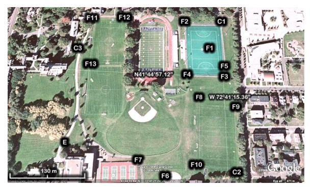
Figure 1. Experiment setup

Tests at Trinity College: The experiments consisted of five persons each carrying an Android Developer Phone running the decentralized POSIT system. The devices have a range of 300 meters when there is free line of sight, with obstacles the range decreases significantly. The nodes moved (by walking) in an area of 350mx350m. This translates to a coverage factor of 5 \cdot 3002 \cdot \pi/(350 \cdot 350) \approx 2.3 . Since the nodes will move away from the center of the map, the network will be disconnected most of the time. A map of the area is shown in Figure 2.