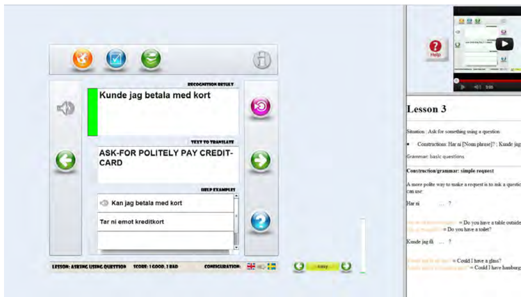
Figure 1: The version of CALL-SLT (Swedish for English-speakers) used in the main study.

and Kaplan, 1993; Crouch et al., 2007), which has formed the basis of the PARGRAM parallel LFG grammar consortium (Butt et al., 2002); a second is the Open Source Grammar Matrix project (Bender et al., 2002). Other substantial grammar-based programs include Gothenburg University's GF (Ranta, 2004; Ranta, 2007) and the Open Source Regulus platform (Rayner et al., 2006).