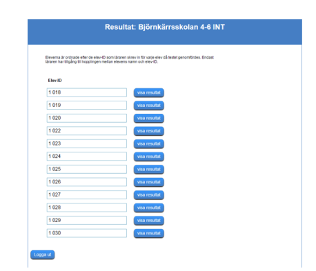
Figure 2: Teacher start up page. The text in the box can be translated as: "The students are organised according to the student ID's that the teacher gave them when they did the tests. Only the teacher that can identify an individual student." ElevID can be translated to "Student ID" and visa resultat can be translated to "show results"

When logging on to the system the teacher will see a list of all the students of his or her class that have results stored in the system, see Figure 2. Privacy is important, especially allowing researchers access to the results without revealing individual students ID, but at the same time allowing teachers to monitor individual students. Therefore, the list comprises student IDs only. The teacher will have a list not accessible in the system where all the IDs are connected to specific students thus keeping the students' data anonymous in the system.