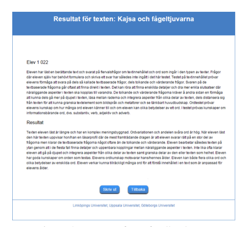
Figure 3: Excerpt from feedback text

sultat" comprise three parts: a descriptive text on how the student handles questions concerning their ability to retrieve explicitly stated information and make straightforward inferences, another similar text on the students comprehension of questions that are oriented towards interpreting and integrating ideas and information and reflect on, examine and evaluate content, language, and textual elements and finally a text generated from the vocabulary test score that describes the students vocabulary. The text in the lower part in Figure 3 can be translated as: