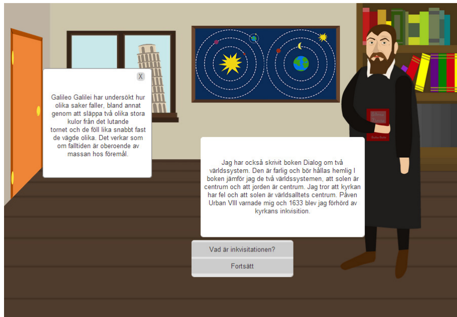
Fig. 1. The picture shows a historical setting with Galileo Galilee.

The information gathering activities are performed with a time machine. During travels to the past the student can visit different historical settings and interact with people, documents and artefacts. See Fig. 1 for the historical setting where the student is visiting Galileo Galilee in Pisa.