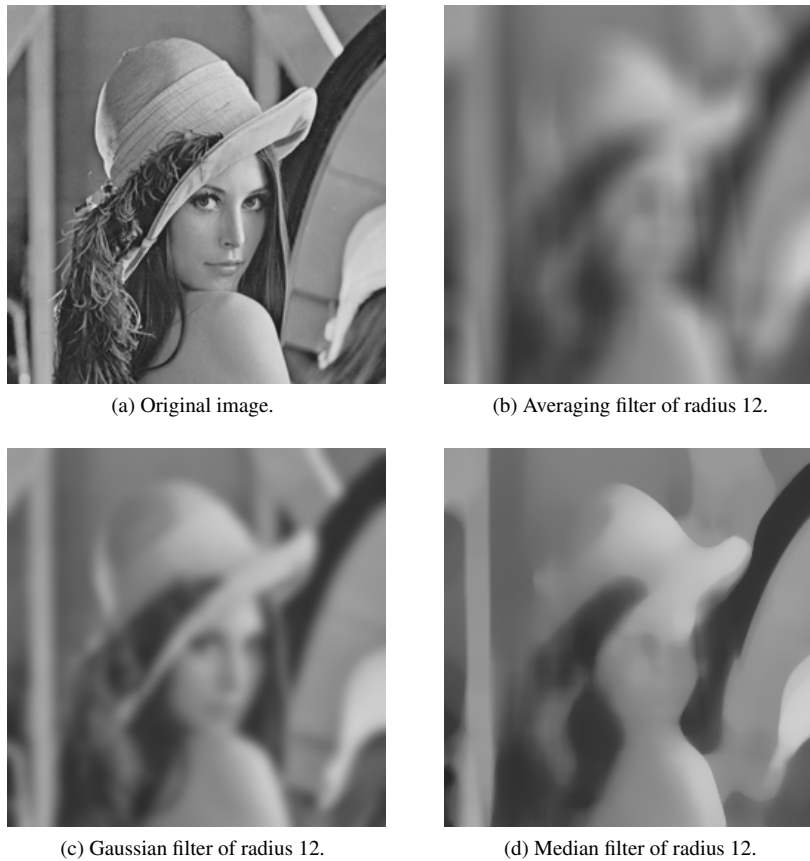
Figure 2: Example output of the image filters.