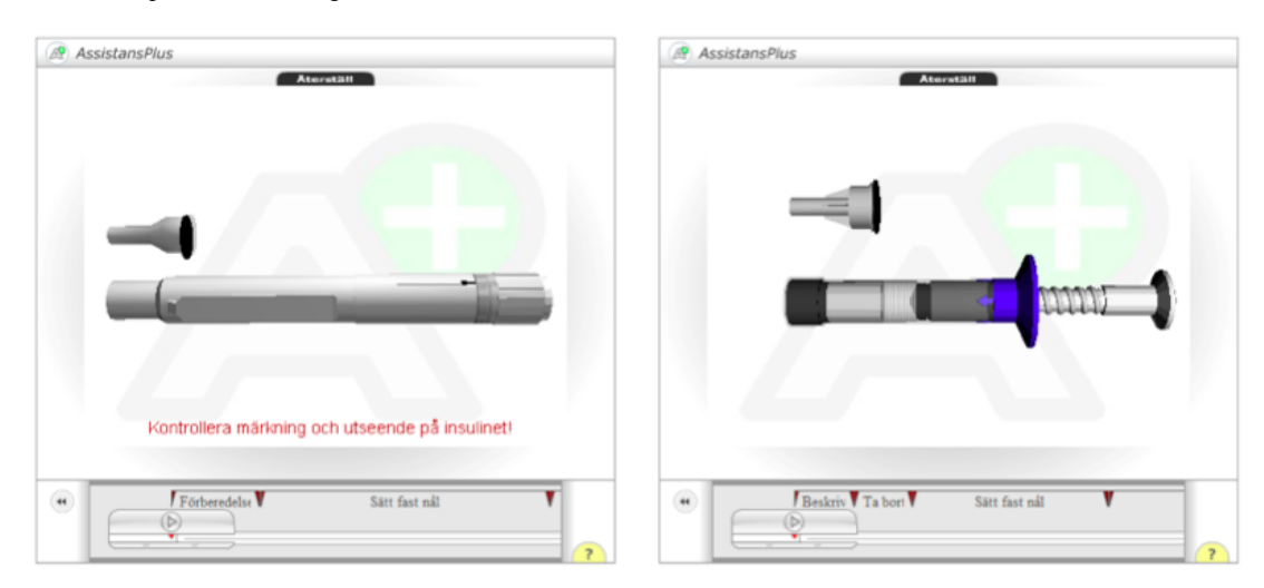
Figure 3. The 2 pharmaceutical products used in the second user study displayed using the second version of the 3-dimensional player: Lantus OptiSet (left) and Genotropin MiniQuick (right)