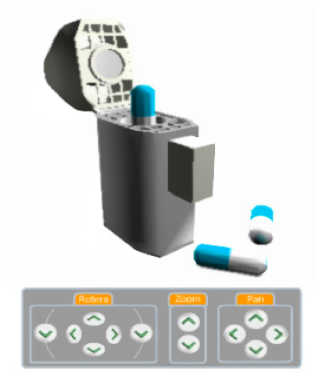
Figure 2. The Ingelheim asthma inhaler displayed using the first version of the 3-dimensional player

A semistructured interview was administered on a separate occasion. The interview covered the following areas: general impressions; specific impressions concerning audio and video features, co-browsing features, and 3D; locus of control (self/advisor); level of activeness (self/advisor); usefulness of service; and target audience.