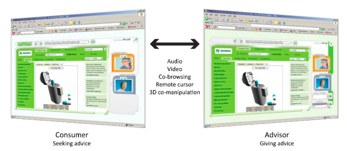
Figure 1. AssistancePlus, a tool for 3-dimensional (3D) -supported advice-giving on pharmaceutical products over distance

Figure 1 shows a screenshot of AssistancePlus with the first version of the 3D player being used to demonstrate handling instructions for an asthma inhaler. The main features of AssistancePlus are (1) co-manipulation of shared 3D objects representing pharmaceutical products, (2) two-way text and audio/video communication, and (3) co-browsing of webpages with synchronized page scrolling and remote cursors